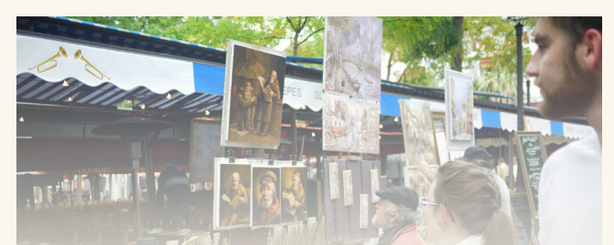
Guests taking an extension may be on a different flight than their group and/or traveling companion. *A 3.5% surcharge will be added to all credit card transactions.

After checking out of your hotel, visit Montmartre, long known as the city's premier artist's enclave. During the mid to late 1800s, artists also began calling Montmartre home. Pissarro and Jongkind were two of the first to live there, followed by other notable artists. For easy access to Montmartre, hop aboard the funicular railroad that ascends the hill. Montmartre's most recognizable landmark is the Basilica du Sacré-Coeur, constructed from 1876 to 1912. The white dome of this Roman Catholic basilica sits at the highest point in the city. You'll then board the ship in Paris for your Paris & Normandy cruise. (B, D)